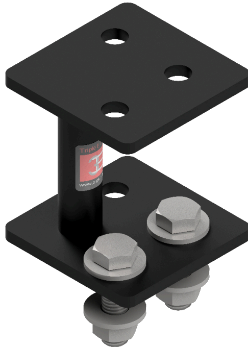
Plate - Curved Track